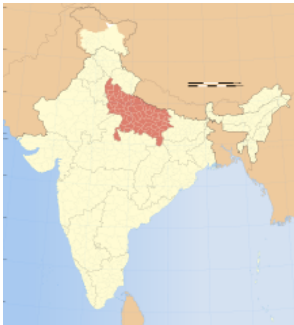
Figure 2: Map of Uttar Pradesh, India.

There is a wealth of literature, however, on the role stigma and discrimination play in maternal care and PPTCT for WLH. Two studies in India elucidate how stigma and discrimination, including lack of confidentiality, health providers not providing appropriate treatment and increased costs for procedures, are common in both private and public settings. WLH report hesitancy to seek further care for fear of how they will be treated in facilities. 9,25 It is well documented that actual or fear of stigma affects use of maternal care and PPTCT services for both seropositive and seronegative women in settings throughout the developing world. 26–32 Thorsen and colleagues argue that several aspects of PPTCT are catalyst to stigmatization in and of themselves, and that specific strategies should be applied to alleviate this process. 33 In an important comparison, however, Kinuthia et al found that health system factors were more influential than stigma in uptake of PPTCT services, 34 suggesting that gaps in quality may be an important underlying factor for use and effectiveness of these services.